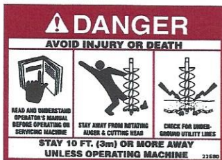
PART #22680 DANGER DECAL (LOCATED ON THE MOTOR/PLANETARY HOUSING)

REPLACING SAFETY DECALS: Clean the area of application with a nonflammable solvent, then wash the same area with soap and water. Allow the surface to dry. Remove the backing from the safety decal, exposing the adhesive surface. Apply the safety decal to the position shown in the diagram, and smooth out any bubbles.